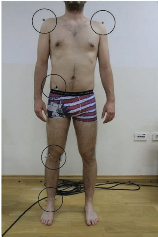
Figure 2. Final body position while performing MTT