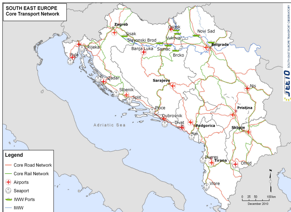
Figure 2. South East Europe Core Transport Network

Analogue to the TINA project, which was completed in 1999, an whole series of projects was initiated for determining the regional transport network for South-Eastern Europe and the evaluation of the required investments – Transport Infrastructure Regional Study (TIRS) and Regional Balkans Infrastructure Study (REBIS) were used as the basis to start the SEETO program of defining the basic regional transport network for South-Eastern Europe.