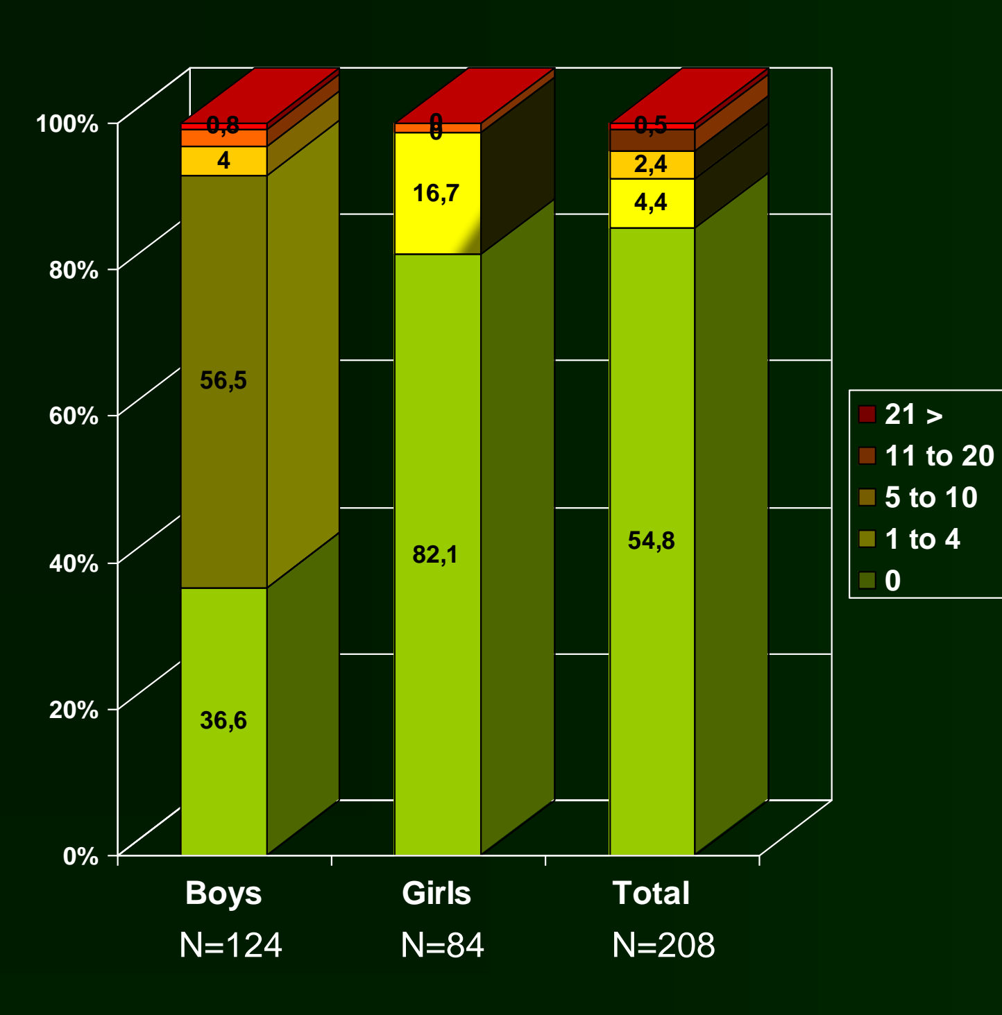
Graph 4. Percentage of reported fear of pregnancy among adolescent boys and girls