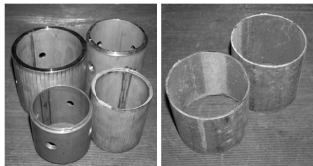
Fig. 1. Two sets of LWPs obtained for testing

Several samples of LWP with different characteristics were obtained, as shown in Fig.1. In some samples, seam weld is optically visible. Some of selected pipes also have holes present. In second case, there is very low contrast between weld and rest of material due to corrosion, but seam weld is still detectable as geometric feature.