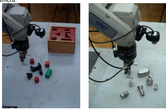
Fig. 1. Experimental system

Industrial robot AdeptSix 300 is used for part manipulation. Standard PC (P4@2GHz with 512MB RAM) running Linux 2.6 kernel (Ubuntu 6.06), equipped with inexpensive consumer 0.8 megapixel webcam is used as platform for MV system. Camera is mounted on top of robot gripper, as shown in figure 1. Advantage of mounting camera on robot is in possibility of expanding system to perform multiple tasks using single camera.