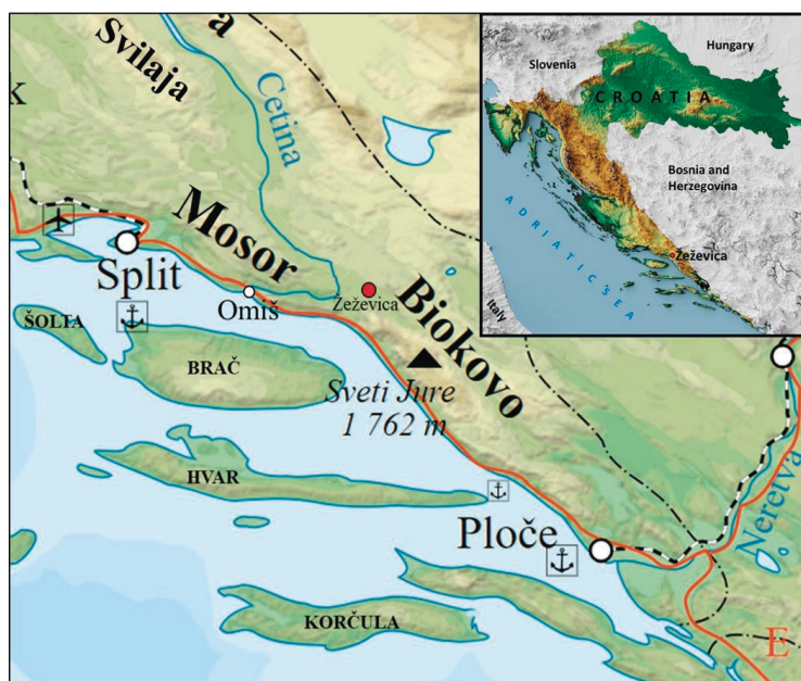
Fig. 1. Geographical position of the Žeževica settlement in central Dalmatia, south Croatia.

as maquis and garrigue (FUERST-BJELIŠ et al. , 2011). The calcareous karst relief and the influence of the Mediterranean climate have given rise to the characteristic flora and vegetation of this area.