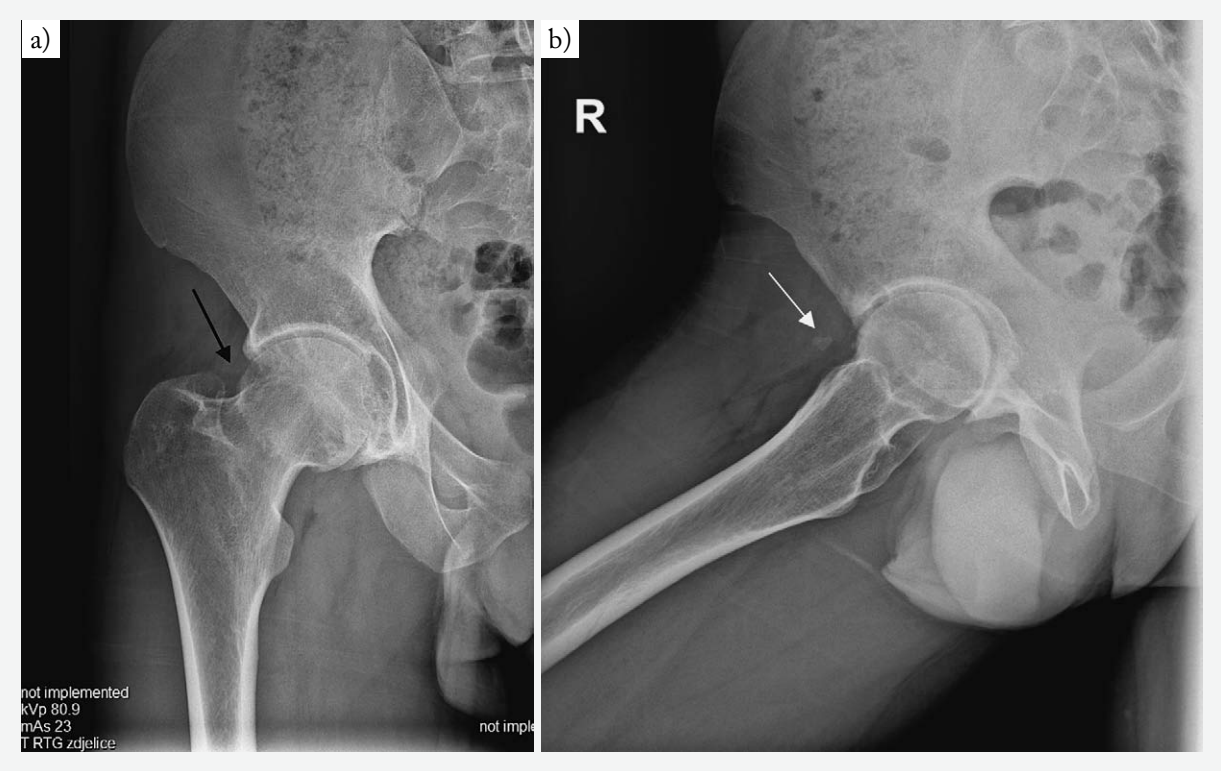
Fig. 1. Preoperative radiographs of the right hip with residual anterolateral cam impingement (black arrow) and a small bone fragment (white arrow); (a) anteroposterior view; (b) lateral frog view.

scribed him antidepressants and referred him to our department.