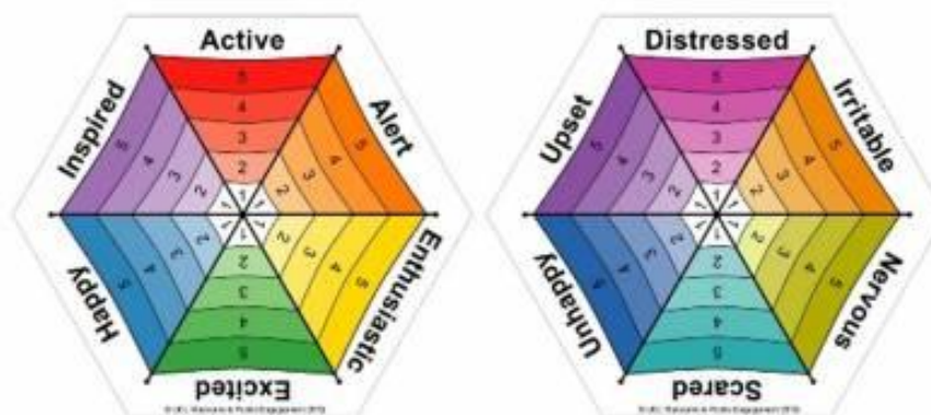
Figure 2. Museum Wellbeing Toolkit. (Thomson and Chatterjee, https://www.ucl.ac.uk/biosciences/culture-nature-health-research/ucl-creative-wellbeing-measures (accessed on 1 November 2022)).