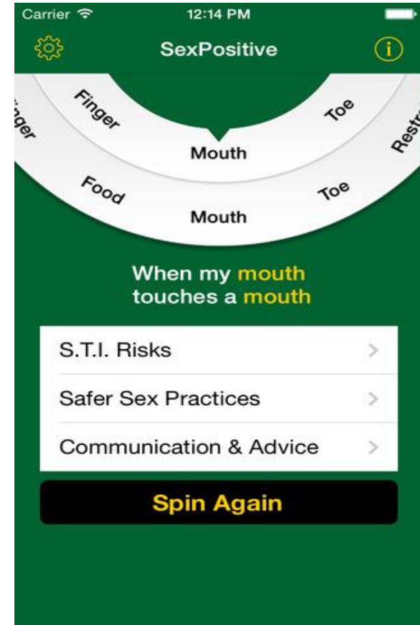
App printscreen: „Sex Positive”, University of Oregon Health Center