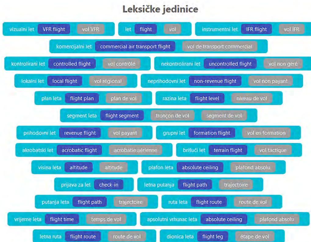
Fig. 2: Croatian, English and French lexical units of the frame Let (eng. Flight ) represented in the search engine airframe.jezik.hr

There are many lexical units evoking the frame Flight , as can be seen in Figure 2. There is no terminological preference given to certain lexical units over others, the way terms are usually classified according to normative preference in a traditional terminological resource. All synonyms and variants of a given term can therefore be added as lexical units because they all do evoke a semantic frame for which the term is relevant. However, spelling and formal variants are usually omitted.