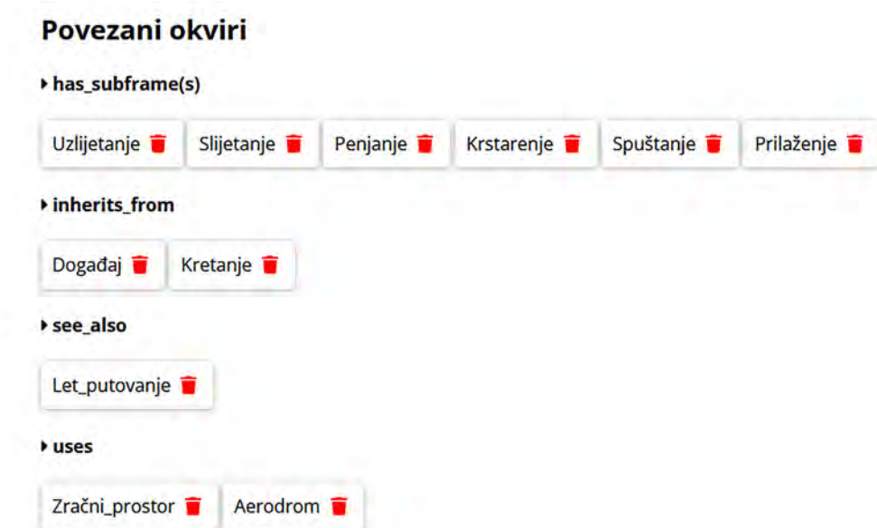
Fig. 3: Frames related to Flight