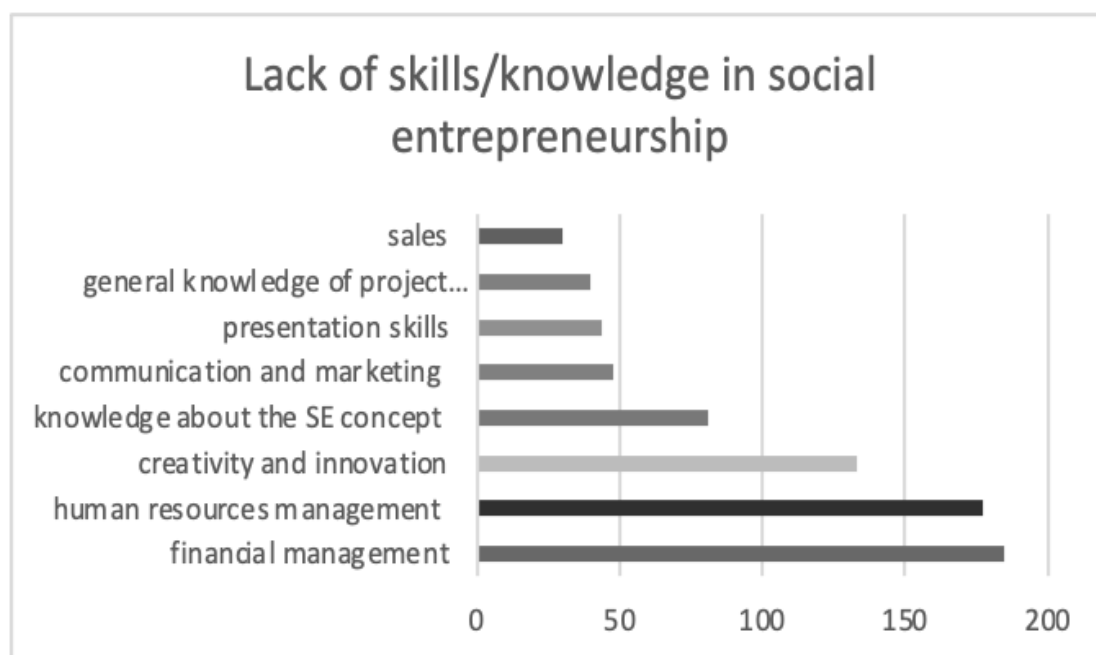
Figure 1. Key skills/knowledge employees in social entrepreneurship lack.