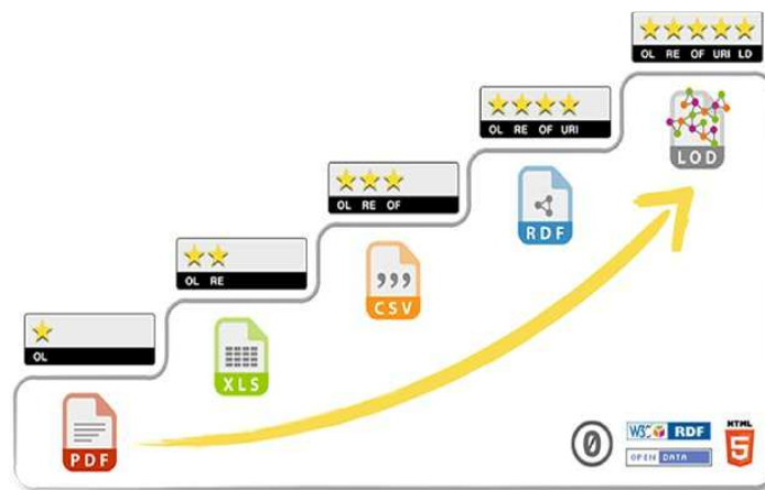
Fig. 1. The 5-Star Open Data Model [25]

The Croatian Bureau of Statistics [17] is an organization that conducts statistics at the state level. Data in the field of transport contain data on rail transport, road infrastructure, road transport of passengers and goods, border traffic, urban and suburban transport, pipeline transport, maritime and coastal transport, traffic at airports and seaports, drivers, registered vehicles and road accidents. Although statistics are kept extensively at the state level and data are open and available for the period of the last ten years, the level of data openness (at least transport data) is low. All available and open data are published under the Creative Commons Attribution [24] license, and the openness of the data is level 2, which would correspond to structured data in a closed format (.xls, .xlsx). For easier comparison, the levels of data openness according to the degree of openness (Fig 1.)