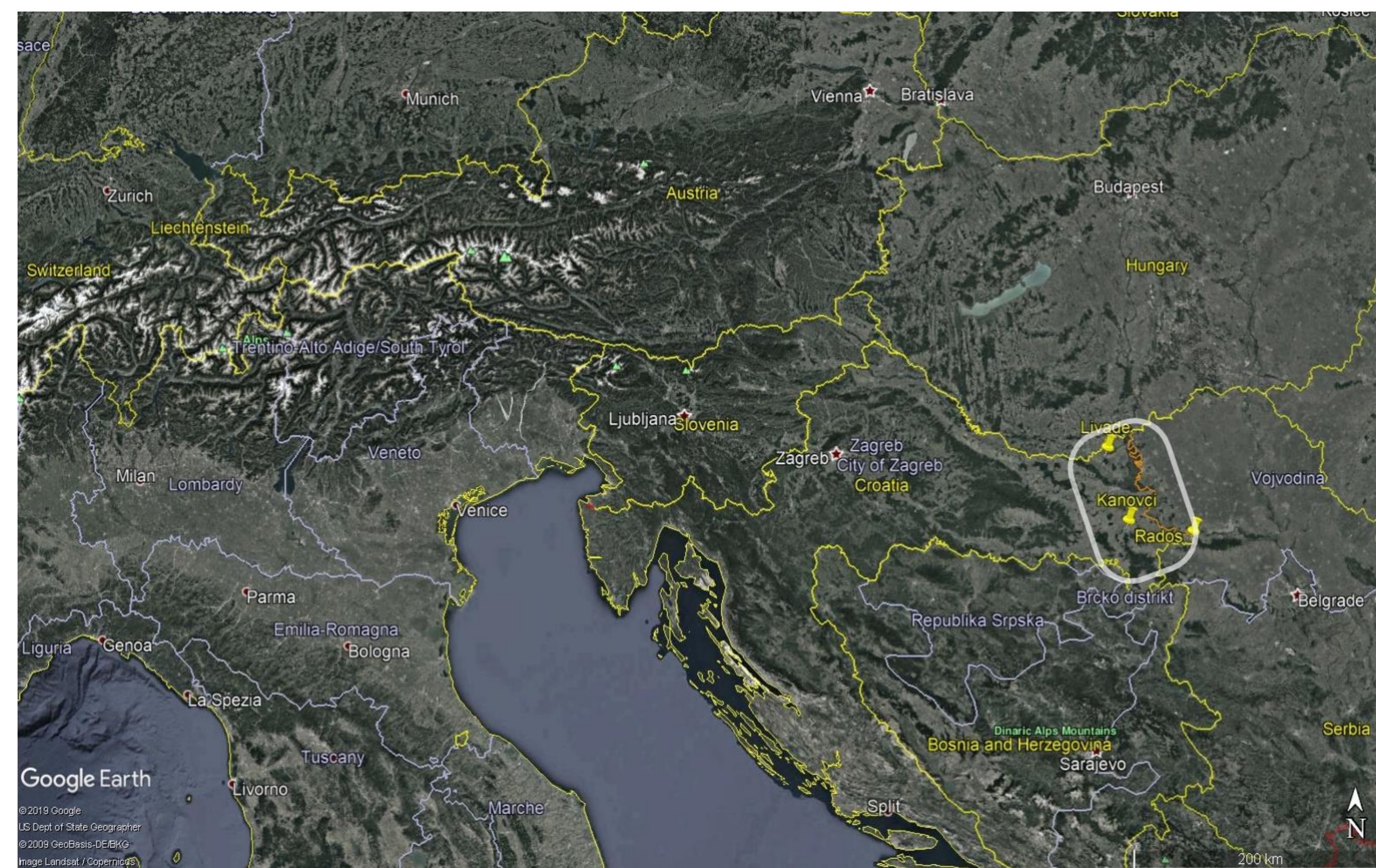
Figure 1. The study sites (Kanovci, Livade, Radoš) in the Eastern Croatia

Croatian loess(-derived) sediments and soils formed on them have not yet been investigated by an interdisciplinary approach that would involve hydrogeology, hydrology, agronomy, soil science and geology/sedimentology. Thus, the 5-year interdisciplinary scientific project ISSAH (lead researcher: Kosta Urumović, Ph.D.) had started in 2018. Main focus is on the specific surface area of particles in loess and loess-derived soils, as it is the property with the key effect on hydrogeological, geomechanical and pedophysical parameters. Project will yield a numerical model of groundwater-flow through the covering aquitard and water-bearing complex, helping the efficient use and protection of soils/groundwater in the area. Also, it will establish an interdisciplinary team able to tackle different and complex environmental issues, particularly in relation to the climate change.