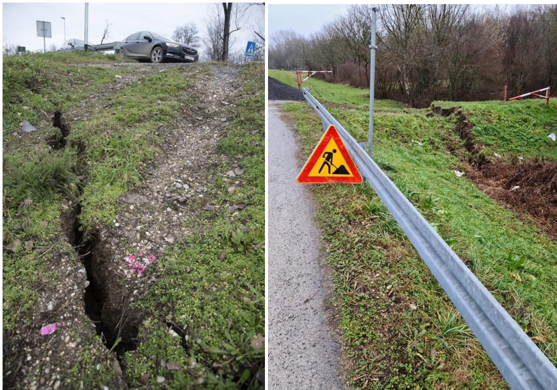
Figure 5. a) Surface fault crossing the Kupa riverbank at Brest Bridge; b) Surface fault rupture crossing the Sava riverbank at Palanjek.

There were numerous cracks along the activated Petrinja Fault that crosses Kupa and Sava River's artificial riverbanks at Brest (Figure 5a) Drenčina, Pračno and Tišina. Besides, some conjugated faults from the system damaged the Sava riverbanks at Palanjek (Figure 5b) and Galdovo.