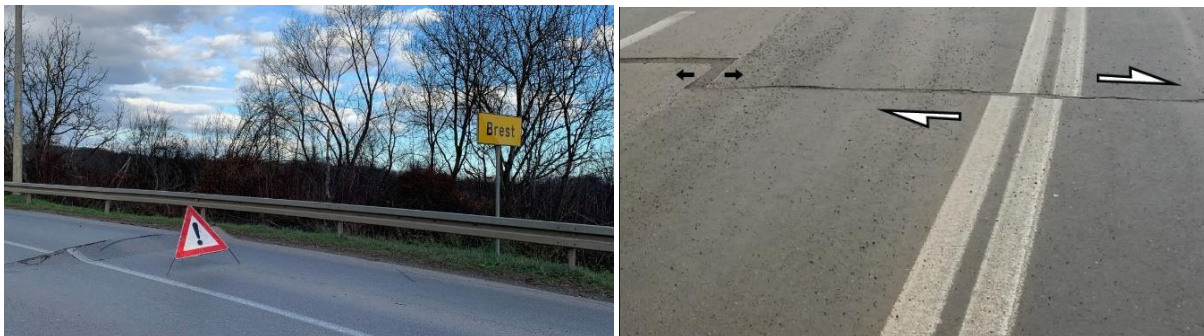
Figure 2. a) Coseismic cracks and small transpressional structure along one of the fault lines of the creeping sinistral Petrinja Fault crossing Petrinja-Brest road south of Brest; b) Coseismic dextral ~10 cm displacement (white arrows) and tensional cracks (black arrows) along the main fault line of the Pokupsko Fault crossing Petrinja-Glina road west of Župić.

Numerous reports in media allowed quick online research of the ground surface failures and infrastructure damage that appear along approx. 30 km long portion of sinistral NE-SW striking Petrinja Fault (Figure 1). A coseismic damage was observed in two locations on the Petrinja-Brest road (Figures 2a and 2b). A quick field inspection revealed that cracks on the road, built on the bedrock of Hrastovička gora at Župić, appeared mostly along Pokupsko Fault, and revealed the clear dextral coseismic strike-slip displacements (Figure 2c).