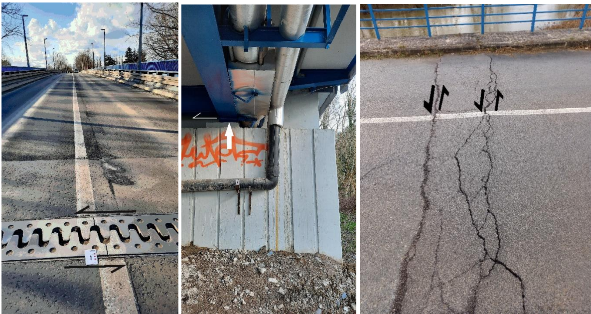
Figure 3. a) Coseismic tensional cracks south of Brest Bridge located between two fault lines of the creeping sinistral Petrinja Fault; b) Coseismic sinistral displacement along N-S fault line of the activated complex fault system crossing the Galdovo Bridge (Sisak); c) shifted construction of Galdovo Bridge (thick arrow) because of sinistral movement (thin arrow) of the blocks along the fault line crossing eastern tip of Galdovo Bridge; d) Coseismic fractures along the main sinistral Sisak-Petrinja-Glina-Topusko Fault line crossing Glina River at Prekopa Bridge.