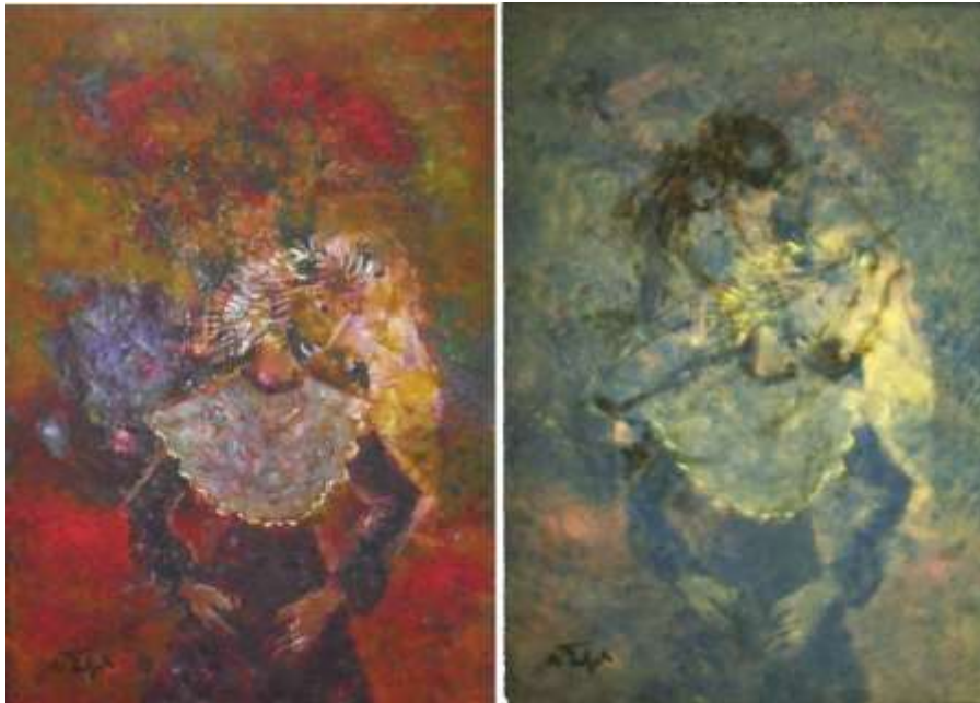
Image 4.1. 4.2: Nada Žiljak, "Zagrljaj", infrared fine art, visual and blockage red Animation at: www.nada.ziljak.hr/n134.mp4

4.2) and a blockage at 665 nm where the blue component remained (Image 4.3). At 850 nm, only those colorants that absorb NIR radiation well remained recognizable. In the painting with a blockage at 590 nm, drawing Z is noticeable since the yellow and part of the red component are "missing". This occurrence of the Z image visibility is enhanced with higher blockages after 600 nm.