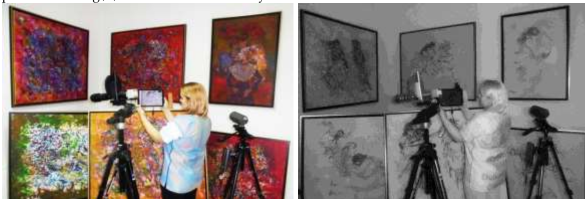
Image 1: Dual information of paintings; visual and near infrared reflectography

using this innovative method of making artwork is new paintings that have found their place in contemporary art galleries /2/. It is suggested to extend the measurement of parameters that describe colors and colorants both in the VIS and NIR spectrum. It is a new tool for studying images of old as well as modern masters. Painting is also improved in the areas of individualization, authorship attribution and the safety of the work of art.