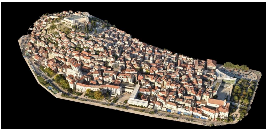
Figure 2. Are of research [10]

Before starting with the practical part, left to define was the exact area of research and the scope of objects (Points of interest – POI) we wanted to include inside our database. As to the area of research we decided upon the medieval old town centre (Fig. 2). As to the scope of POI we used the Registry of cultural heritage led by the Ministry of Culture which contains a list of protected cultural properties [9].