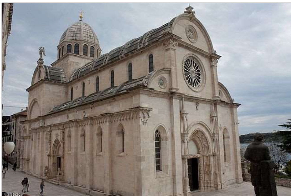
Figure 1. St James Cathedral [3]

In order to be successful in the tourism industry a city like Šibenik has to inform tourist about cultural venues and attractions. On the other hand, considering all the historical sights inside the old town, it is necessary to provide investors and conservators with up to date information about buildings. Being rich in cultural and historical treasures carries responsibility to invest in the revitalization of buildings and conservation of heritage. The prove that in recent years awareness for cultural and historical heritage rises is the fact that the Organization for conservation of cultural heritage in Šibenik ‘Juraj Dalmatinac’ started a project to build an information system of the old town of Šibenik. Nearly all 2 thousand buildings within the old town should get an identification card with attributes, photographs and guidelines for conservation [4].