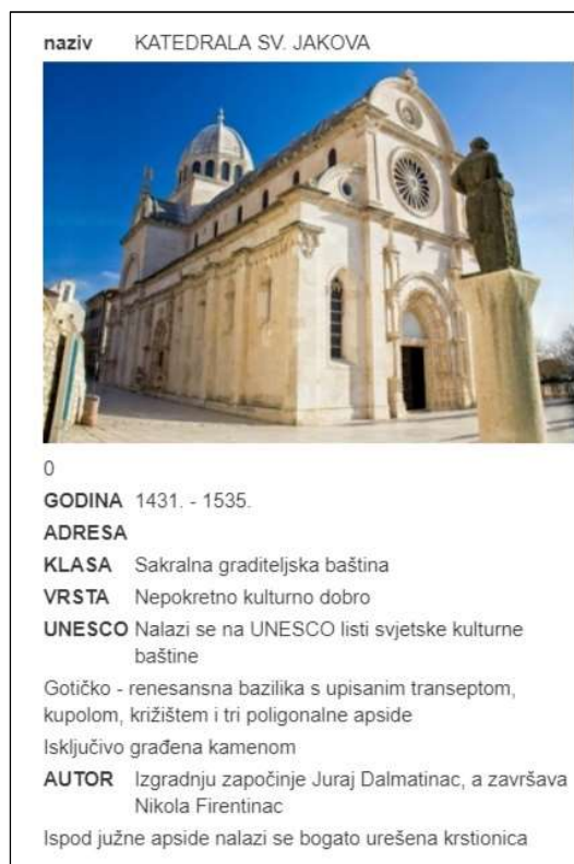
Figure 3. ID card of St. James Cathedral

of the Ministry of Culture in Šibenik. In total we collected data for 52 objects - churches, fortresses, monasteries, palaces, centuries-old preserved buildings and a theatre. Data was collected periodically from April to August 2017. Photographs were taken using a Samsung Galaxy S3 smartphone or retrieved via web. The collected data was processed using Microsoft Excel and saved inside a csv (Comma Separated Values) file. Additionally, we have created identification cards for all objects which will be browsable within our GIS (Fig. 3).