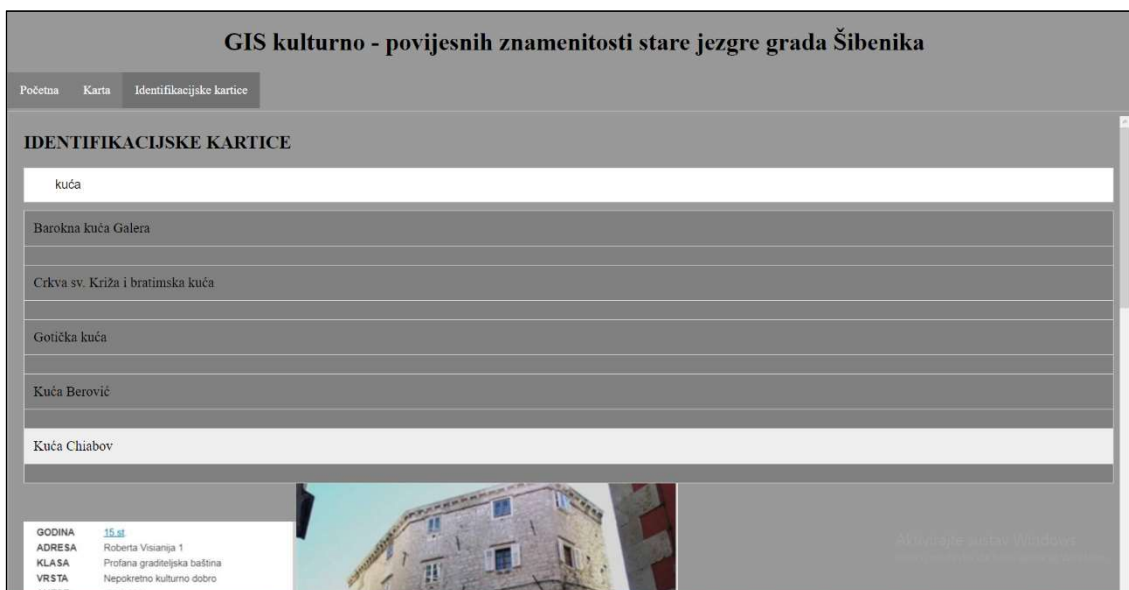
Figure 5. Identifications cards search by key word

In the final step we decided to embed the html file containing the web map inside another html file. This way a home page was created so users can get basic information about the project. In addition, a third web site was created containing identification cards of objects, so users can search through the database. The search is done by key word, i.e. if a user wants to search for a specific church he can type in 'church' and get listed all churches inside the database, or he can type in part of the name so only objects with this name appear in the list (Fig. 5). Last, the GIS viewer had to be published on a web server, so everyone can access it. Using an FTP (File Transfer Protocol) client all files were transferred and the web GIS viewer of cultural and historical sights in the old town centre of Šibenik can be accessed on the following web address: https://gis-sibenik.000webhostapp.com/#karta (Fig. 6).