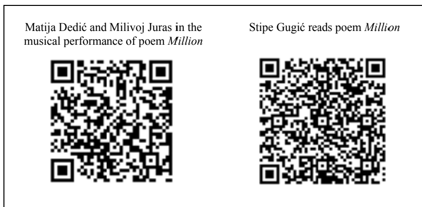
Figure 2. QR codes from Vilijun novel

own archive collection, thus opening up the question of the documentary capacity of the novel itself. 13