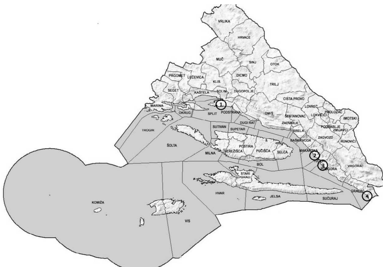
FIGURE 1 – Sampling sites at the Adriatic Coast.

The water samples were obtained from four stations along the Adriatic coast in Southern Croatia (Figure 1). The samples were collected during 3 years, between March 2009 and December 2011. Hot water samples were collected in sterile 1 L bottles containing 180–200 mg sodium thiosulphate to neutralize any chlorine or other oxidizing biocides. At sampling port, the outside of the pipe was disinfected with a flame, water was flushed for 2 minutes and then water was sampled. For each sample, hot water (1L) was collected in duplicate in sterile plastic bottles from hot-water faucets. Samples were stored in the dark, in an insulated container (cool box) at 4°C, transported to the laboratory as soon as possible.