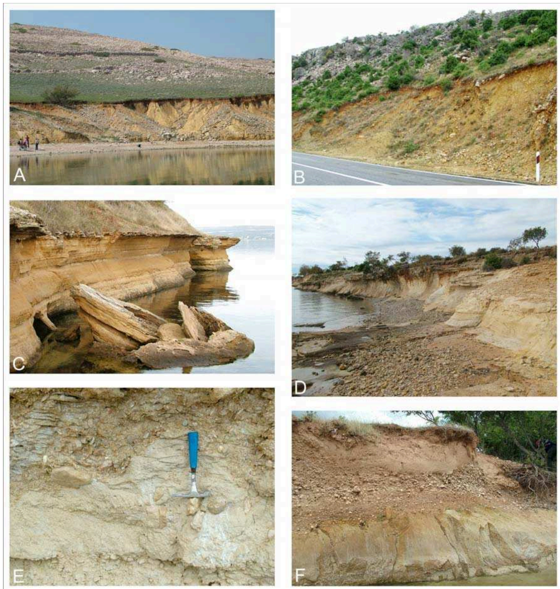
Fig. 2: Outcrops of Middle Pleistocene glaciolacustrine sediments in southwestern Croatia. A) Varved sediments with fossil flora and fauna (distal facies) at location 4 - Ždrilo; B) Laminated silt/clay sediments disturbed by overlaying ground moraine at location 1 - Kusača cove; C) Varve-like sediments with dropstones at the coastal section of location 5 - Novigrad; D) Varve-like sediments with gastropods and bivalve moulds (proximal facies) at the coastal section of location 2 - Seline; E) Laminated clayey silt sediments disturbed by overlaying ground moraine at location 6 - Karin; F) Clayey silt lacustrine sediment covered with paleosol and younger glacial deposits, exposed at location 9 - Žegarsko polje.